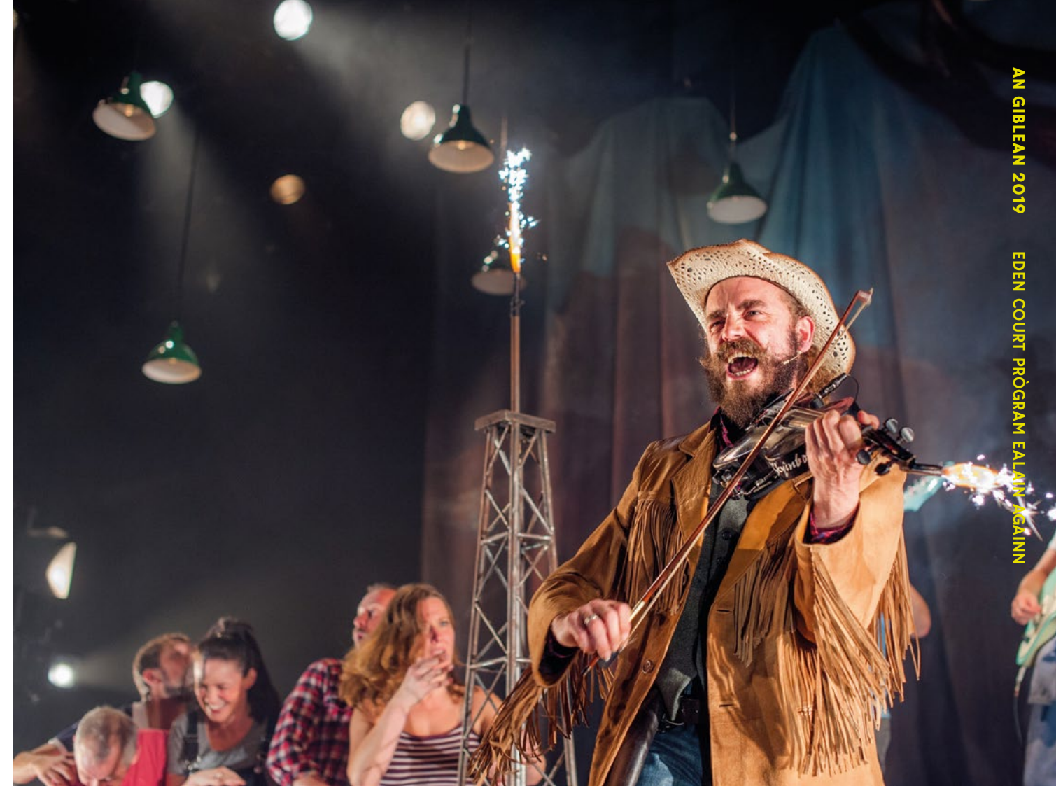
THE CHEVIOT, THE STAG AND THE BLACK, BLACK OIL National Theatre Live + Dundee Rep Theatre

We appreciate and acknowledge that the boundaries around specific artforms continue to blur: Dancers use digital, actors can be musicians, the boundaries between conservatoire-trained talent and non-conservatoire-trained talent are complex, and so-on. We're interested and motivated by these challenges, debates and working practices. We enjoy talking about them.