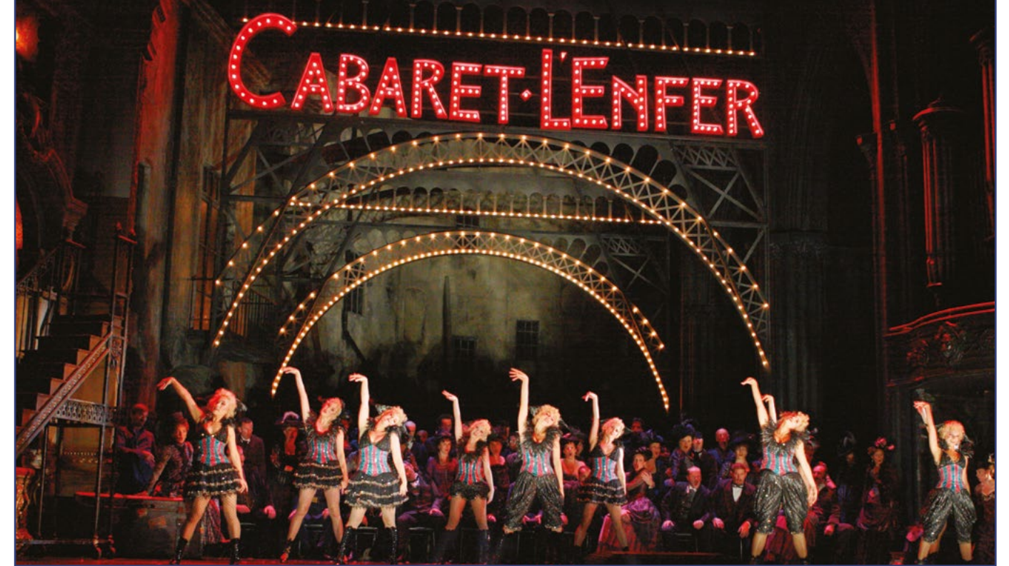
FAUST Apr 2019

We publish two brochures/seasons per year in March for the season April – September and in September for our season October – March.