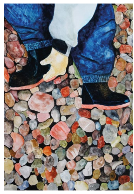
ELLIOT'S STORIES -AGA SPALDING May 2019