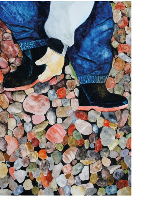
ELLIOT'S STORIES -AGA SPALDING May 2019